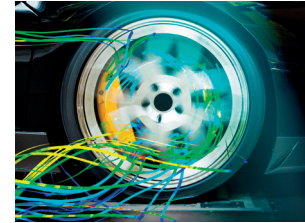
Experimental and numerical investigation of the flow through a rotating wheel

Objective 1: Understand basic aerodynamic physics and relationships; apply fundamental aerodynamic equations on standard flow situations; assess aerodynamic coefficients and aerodynamic results; influences on vehicle drag and lift as well as vehicle dynamics.