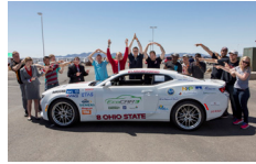
Ohio State's EcoCAR 3 national championship team

Evaluate energy consumption in road vehicles. Relate energy demand of driving cycles to fuel economy and CO 2 emissions. Understand basic energy models of IC Engines, electric drives and energy storage systems. Understand the concept and potential benefits of drivetrain hybridization strategies. Explore these concepts in simulation using a PHEV simulator.